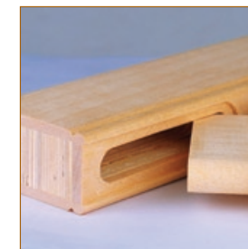
Engineered Stiles and Mortise-and-Tenon Joinery