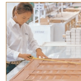
Fully Assembled Quality Control